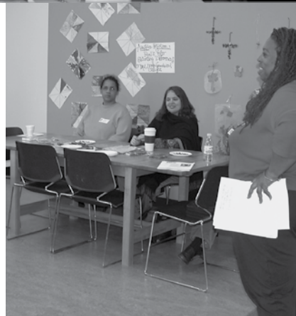
top row: Serenity and Scent, Lessons from the Cosmos—Fabric Collage; 2d row: Poems, Parables, and Earth Songs, Tender Mercies and Small Blessings; 3d row: raffle browsing, Embodying the Sacraments; 4th row: Bend Me, Fold Me: Spirit and Paper; Beaded Prayers.

Look for more photos and video on our website.