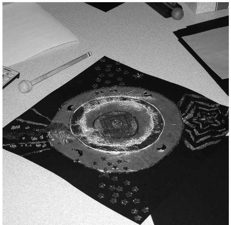
Arti Gras 2010: Lessons from the Cosmos